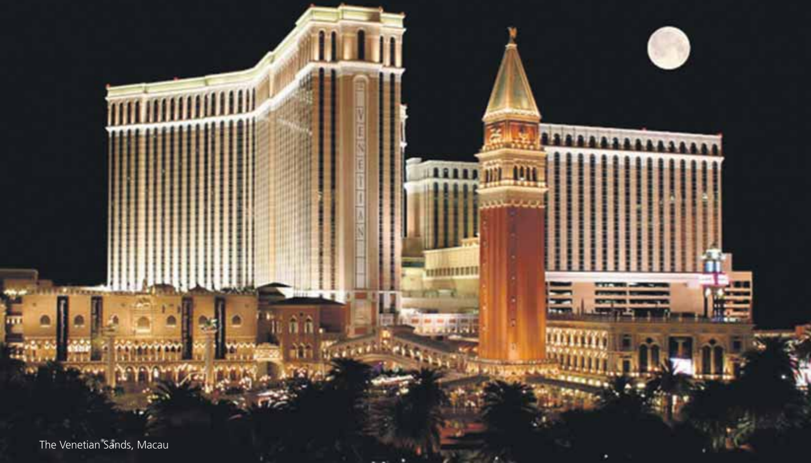
The Venetian Sands, Macau