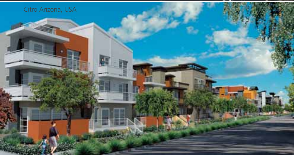
Citro Arizona, USA