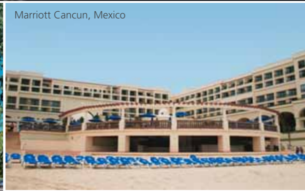
Marriott Cancun, Mexico