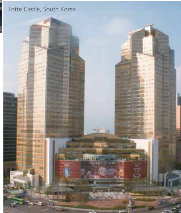
Lotte Castle, South Korea

As one of the world's leading faucet manufacturers, DELTA has supplied to world-class projects on a global scale. With such confidence shown in DELTA's products, it comes to no surprise that DELTA faucets have exceeded the highest expectations of renowned architects and developers internationally.